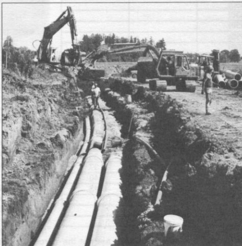
You'll have to take our word for it that these pipes are purple.

trench connecting three USA wastewater treatment plants. Two 24-inch PVC pressure pipes and one 3-inch PVC electrical conduit run the full