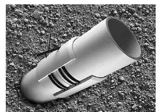
Spline-Lock Gasketed Joint

This joint uses a nylon locking spline that is inserted into mating grooves in the pipe spigot and the bell/coupling. Spline-lock joints form a non-metallic mechanically restrained joining system that can be disassembled and reused if necessary.