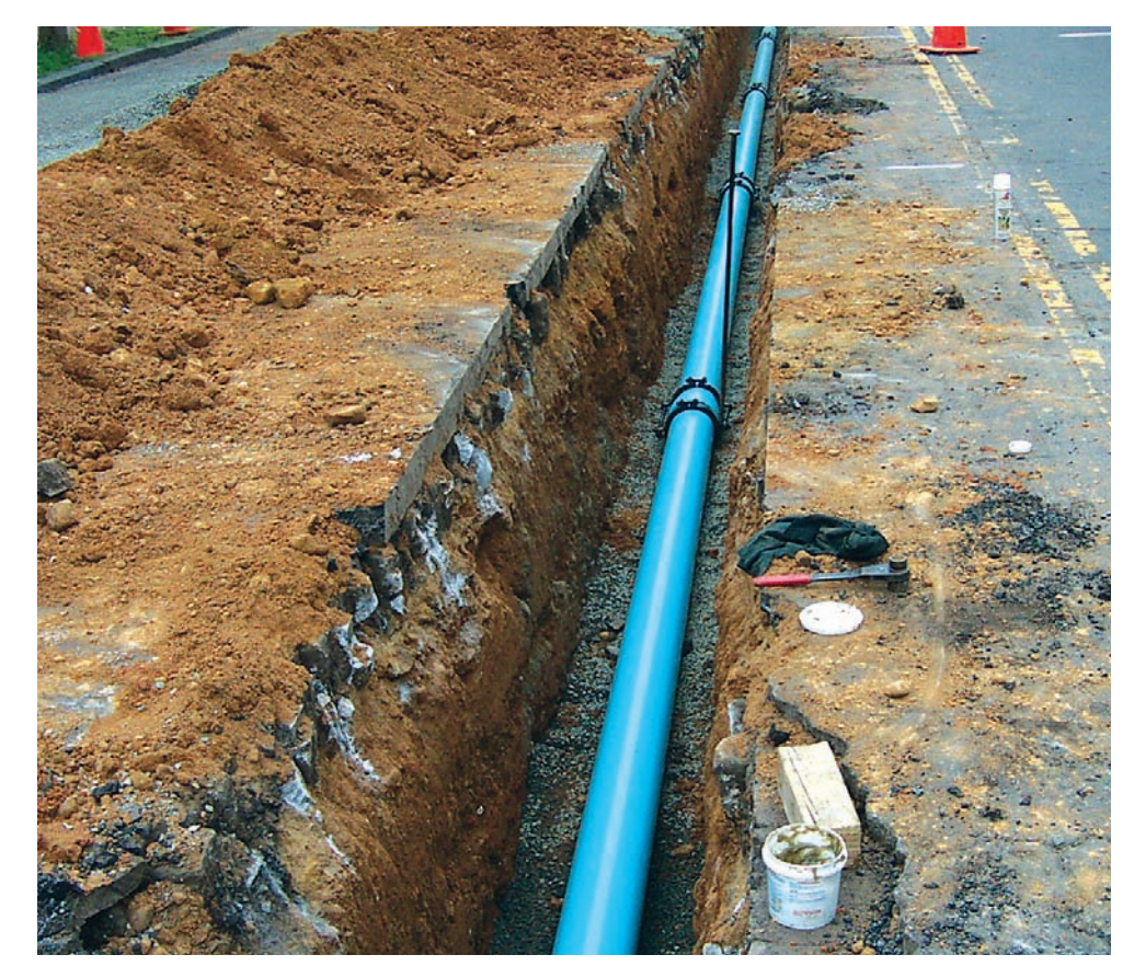
Figure 1b. The 8-inch PVC replacement mains were installed "quickly and smoothly" four-feet below grade.