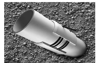
Spline-Lock Gasketed Joint

This joint uses a nylon locking spline that is inserted into mating grooves in the pipe spigot and the bell/coupling. Spline-lock joints form a non-metallic mechanically restrained joining system that can be disassembled and reused if necessary.