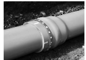
Pin-and-Groove Gasketed Joint

In this joining system, when the pipe is assembled, a groove on the outside of the pipe spigot aligns with holes spaced around the pipe bell. Pins are hammered through an external ring, through the holes in the bell, and bottomed out in the spigot groove. Pin-and-groove (also known as “ring-and-pin”) joints have no metallic components.