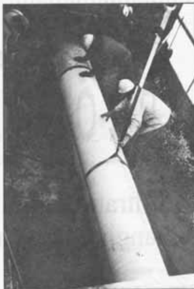
Joint is lined up for quick coupling and insertion.