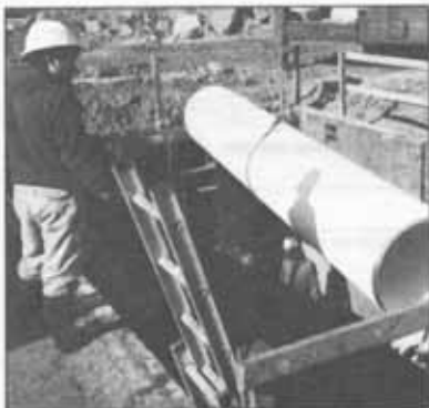
Slipline lowered into shored insertion pit.