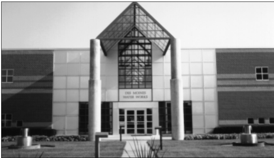
Des Moines Water Works is a public utility that operates under a Board of Trustees.

contractor likes to push it to its limit. We know if we put that pipe under stress, try to tap it before it has the ability to relieve that stress, we run a risk of it splitting. The whole problem about having to dig out each bell and all that other stuff, that's not an issue. There's enough softness that if the contractor does a good job of preparing the trench bottom, it just settles right in. But the biggest things of concern to us were making sure we didn't drive it "home" when it's cold, which has never turned out to be a problem, and making sure they don't try to over-use bending. Which is still a problem today.