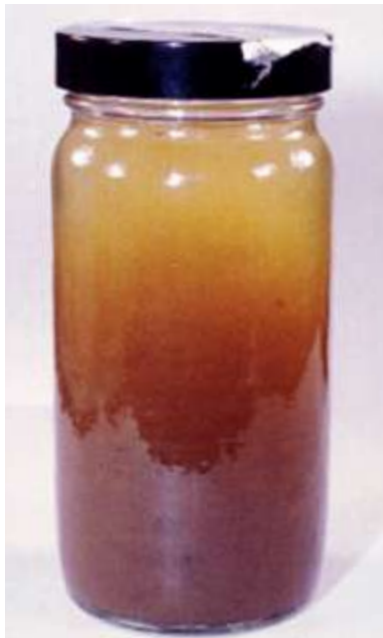
Discolored water from iron sediments re-suspended from mainflushing.

The use of PVC will also allow the City to increase water pressure to the residents by an average of 25 lbs., further improving quality of life and increasing fire-fighting safety.