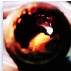
Tubercle formation in iron pipe.

Based upon water industry standards, we do a great job of treating the water. However, we cannot forget about water quality once the water leaves the plant. The underground pipe material which makes up the distribution system that carries water to our homes and families, is also very important